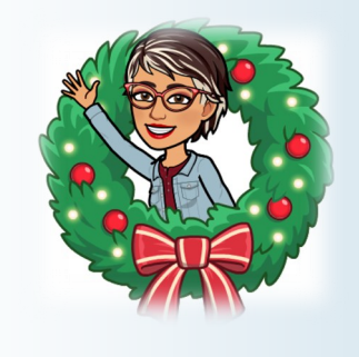
From the desk of: